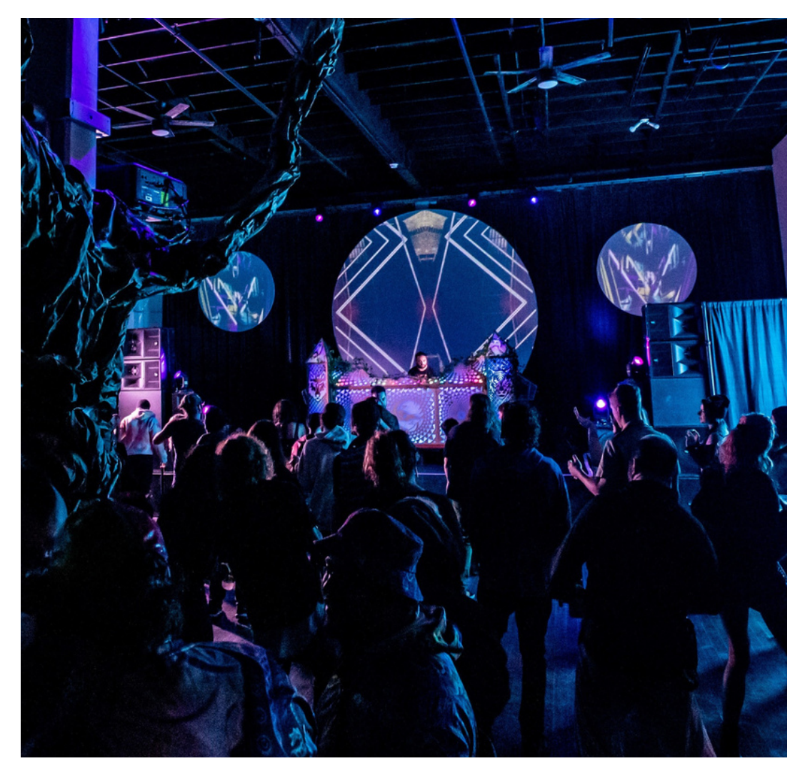
Make yourself at home at The Den.

The Den is a community event & live music center, featuring live performances, world class sound and atmosphere, and rentable venue space.